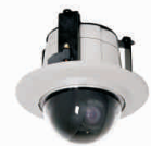
In-Ceiling Mount Type (MBR-200CF)