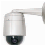
Wall Mount Type (MBR-201W)