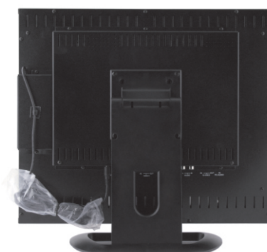
- REAR -