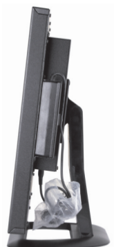
- SIDE -