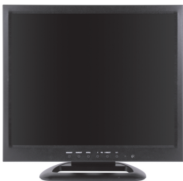
- FRONT -